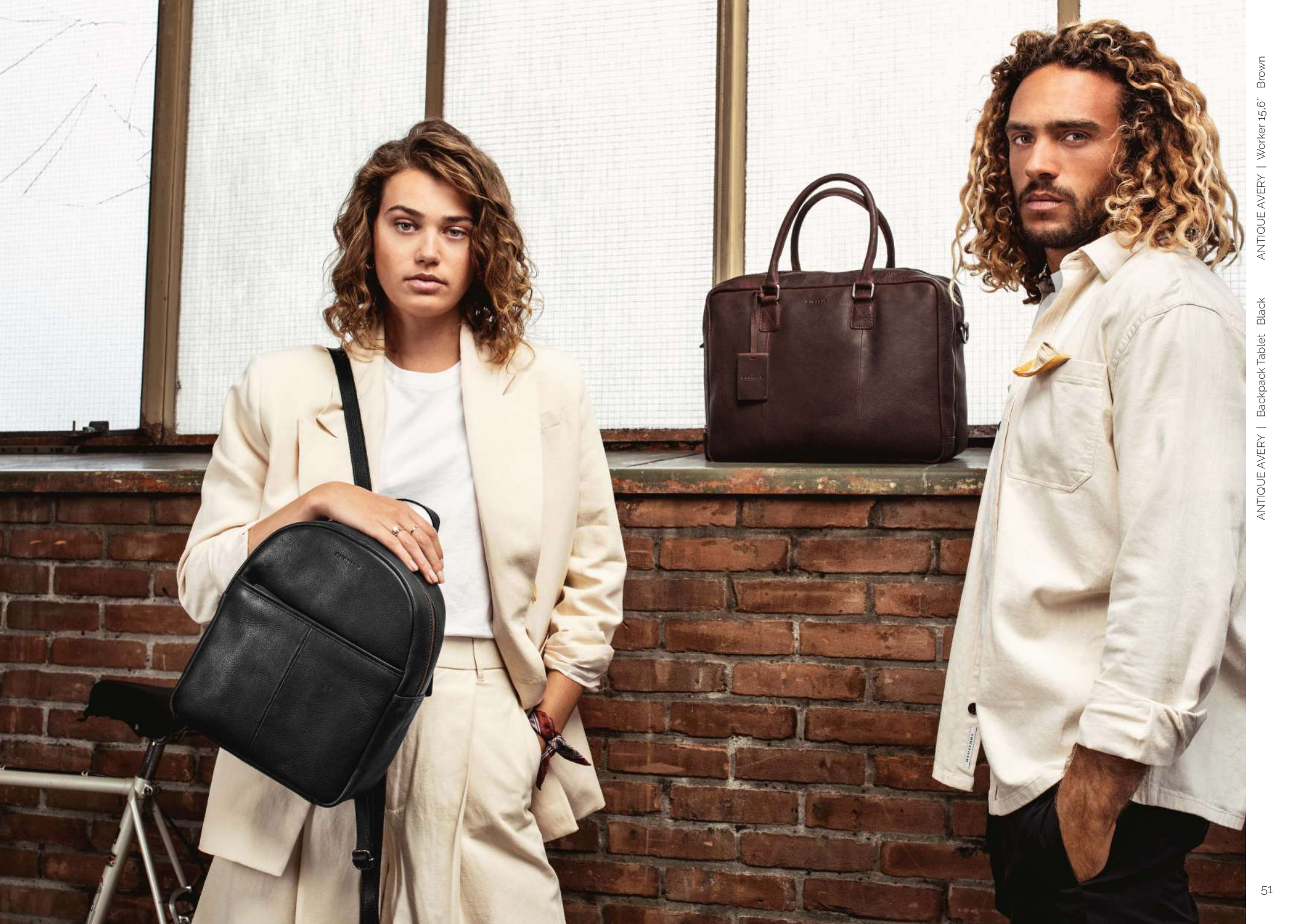
ANTIQUE AVERY | Backpack Tablet: Black | Worker 15,6" | Brown